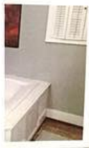
brapenes aste. 1

future swaps to comfortably go on her wish list. Replacing in a sculptural freestanding and creates a focal point or a reclaimed-wood vanity of two small windows in to increase natural light. And a privacy wall for the toilet as a storage unit thanks to "I'm a true believer in form together—and, of course, the and beautiful," Chris says.